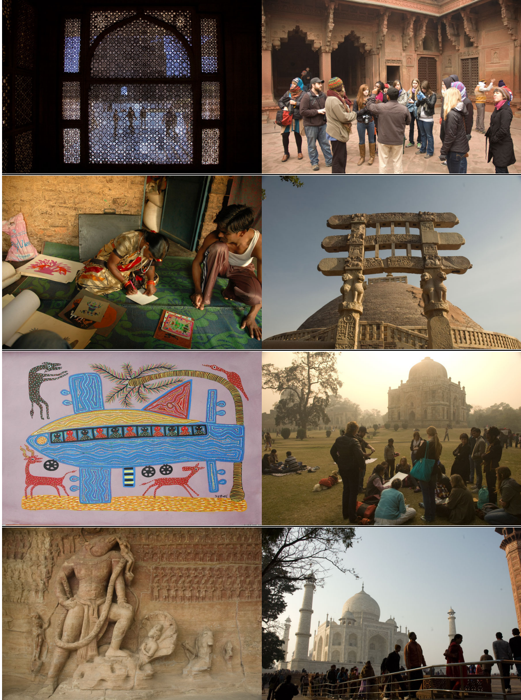
Clockwise from Top Left Corner: a) Magnificent Lattice work in Fatehpur Sikri b) Guided Tour at the Agra Fort c) Meet a Gond Artist at their home d) The 2 nd Century Sanchi Stupa e) A contemporary Gond Painting f) Lodhi Gardens, New Delhi g) A relief in Udaygiri Caves and h) The Taj Mahal, Agra