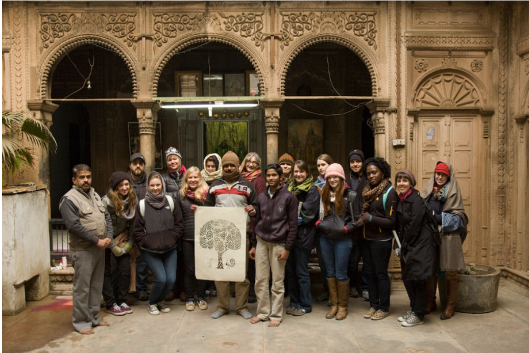
Winterim Students from the University of Iowa in Mathura

Available throughout the year, October to March preferred