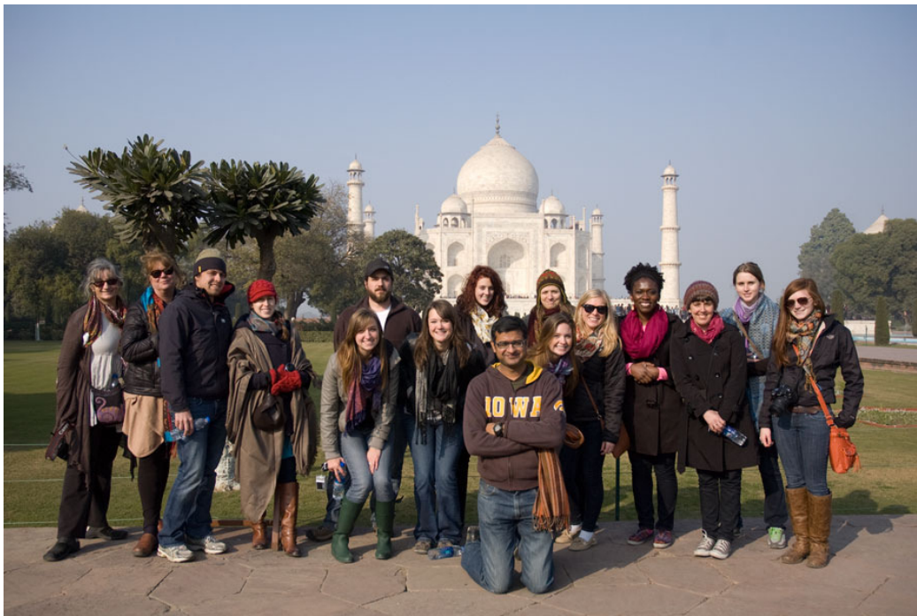
Iowa Winterim Program 2012-13 at Taj Mahal, Agra

Available throughout the year, October to March preferred